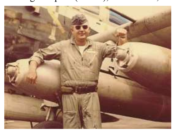
Bien Hoa, Vietnam 1965

Following retirement, I worked for several major aerospace companies as a Senior Logistics manager: GTE on the MX ICBM, Raytheon on Millstar Satellite Communications, AIL on B-lB ECM, Sikorsky for several aircraft logistic support and aircraft maintenance contracts for the Air Force. This was followed by several years of Logistics consulting. For the last several years, I have been flying my own RV-8 aircraft out of Heritage Airpark (TE-86), New Berlin, TX