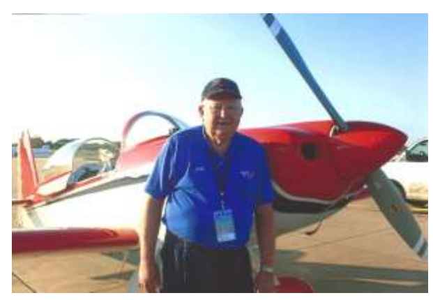
Randolph AFB, GA Safety Fly-In 2015